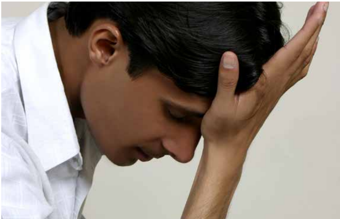
You may feel overwhelmed.