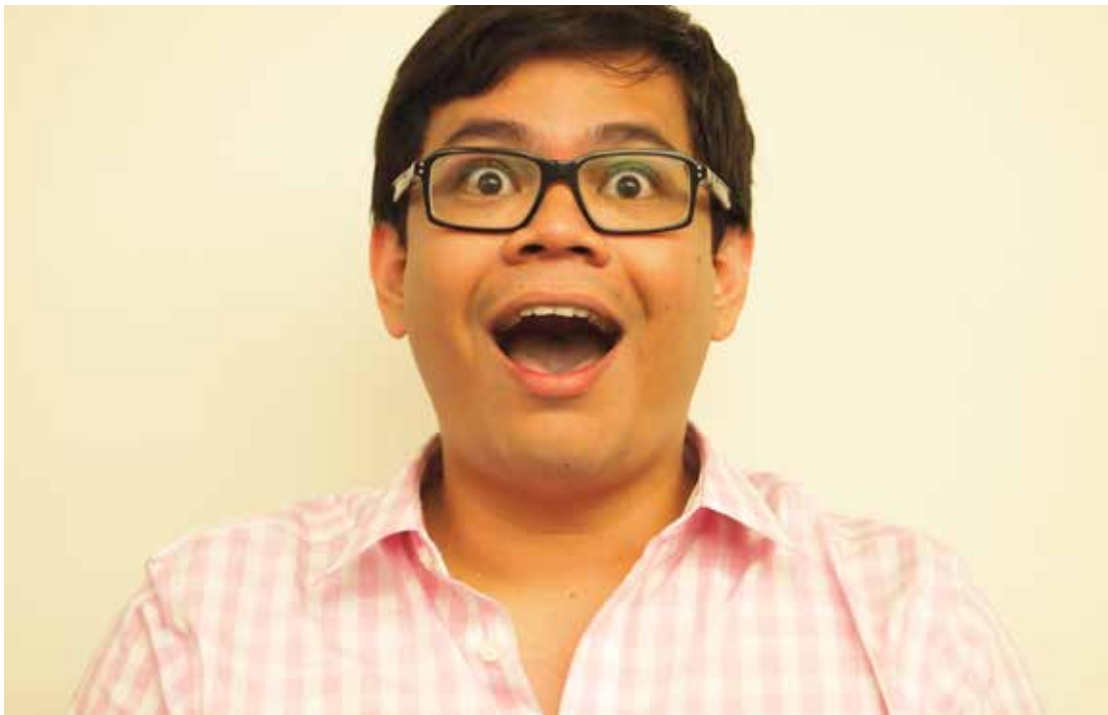
You may feel overly happy.