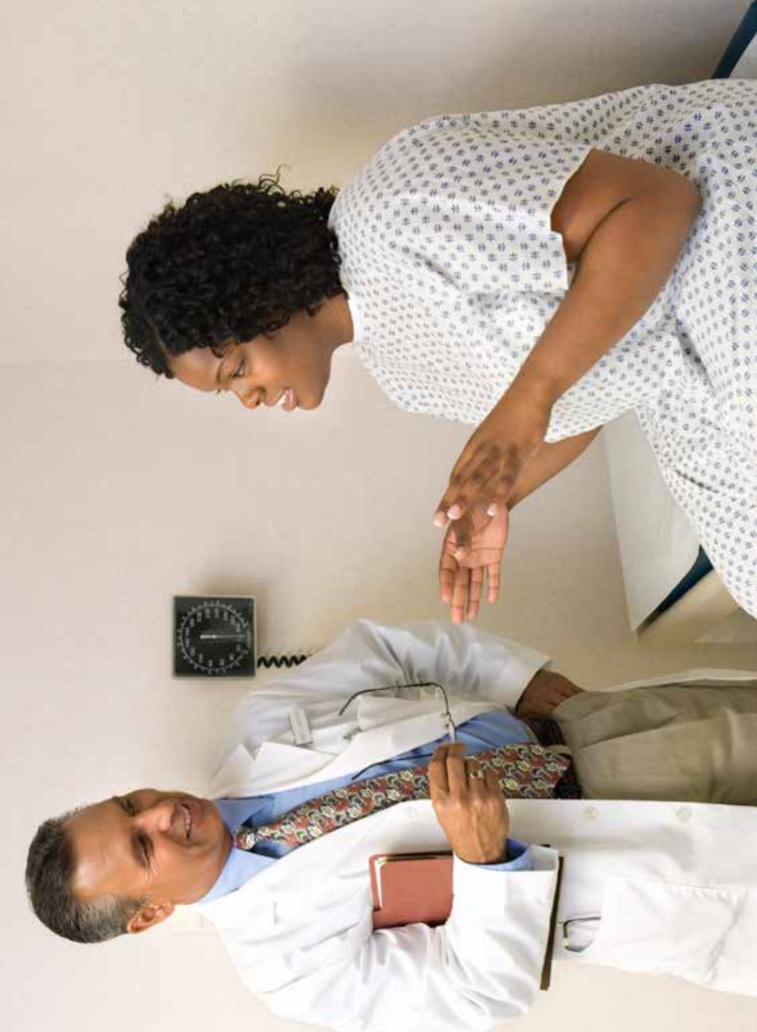
Make an appointment with a doctor.