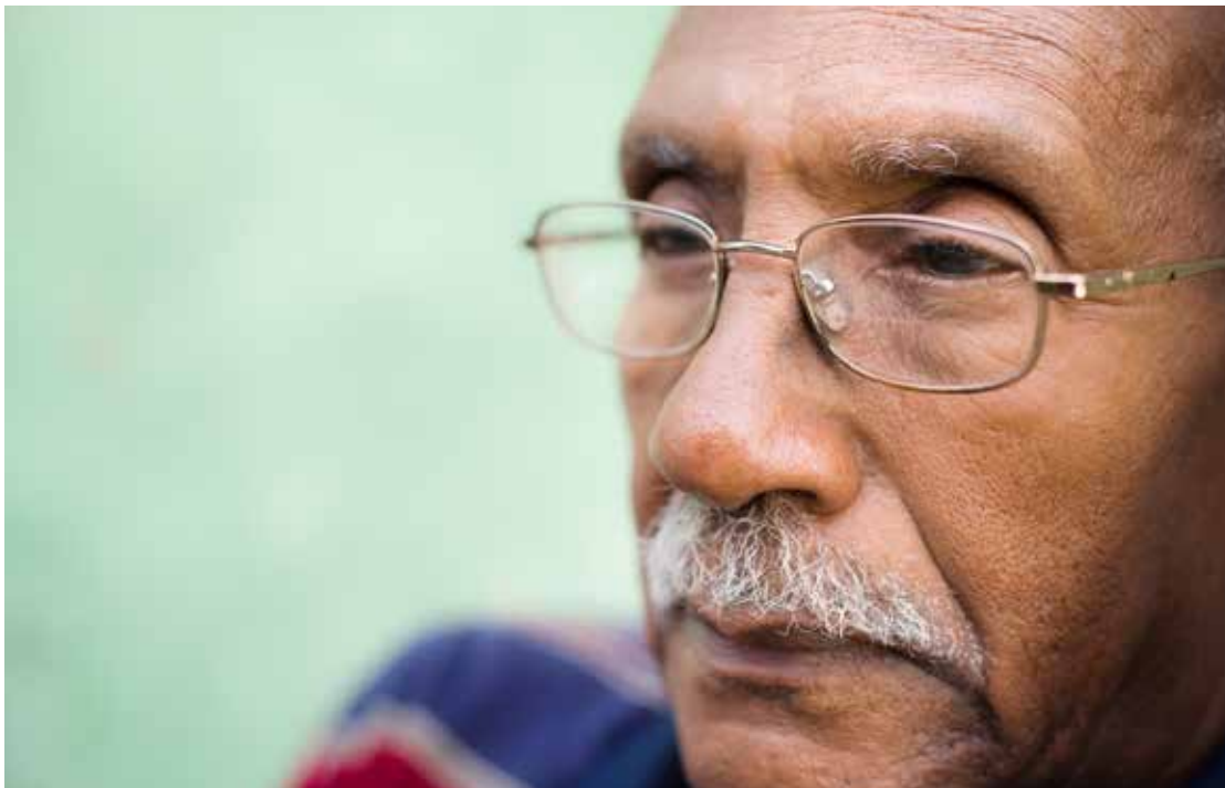
You may feel sad or depressed.