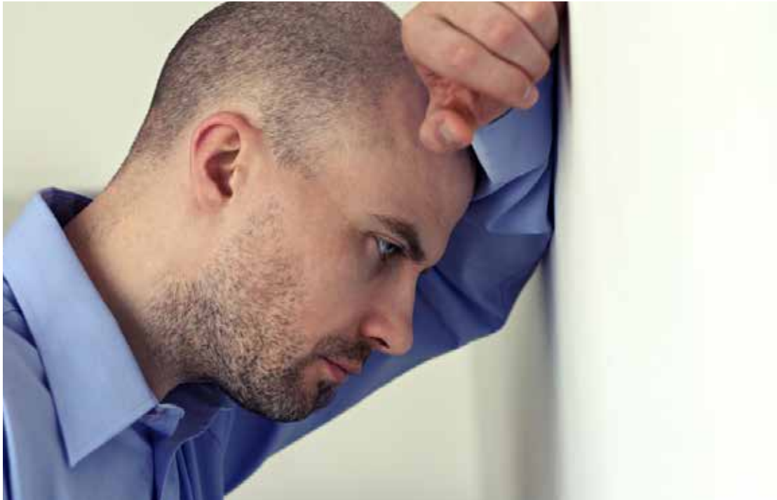
You may feel restless.