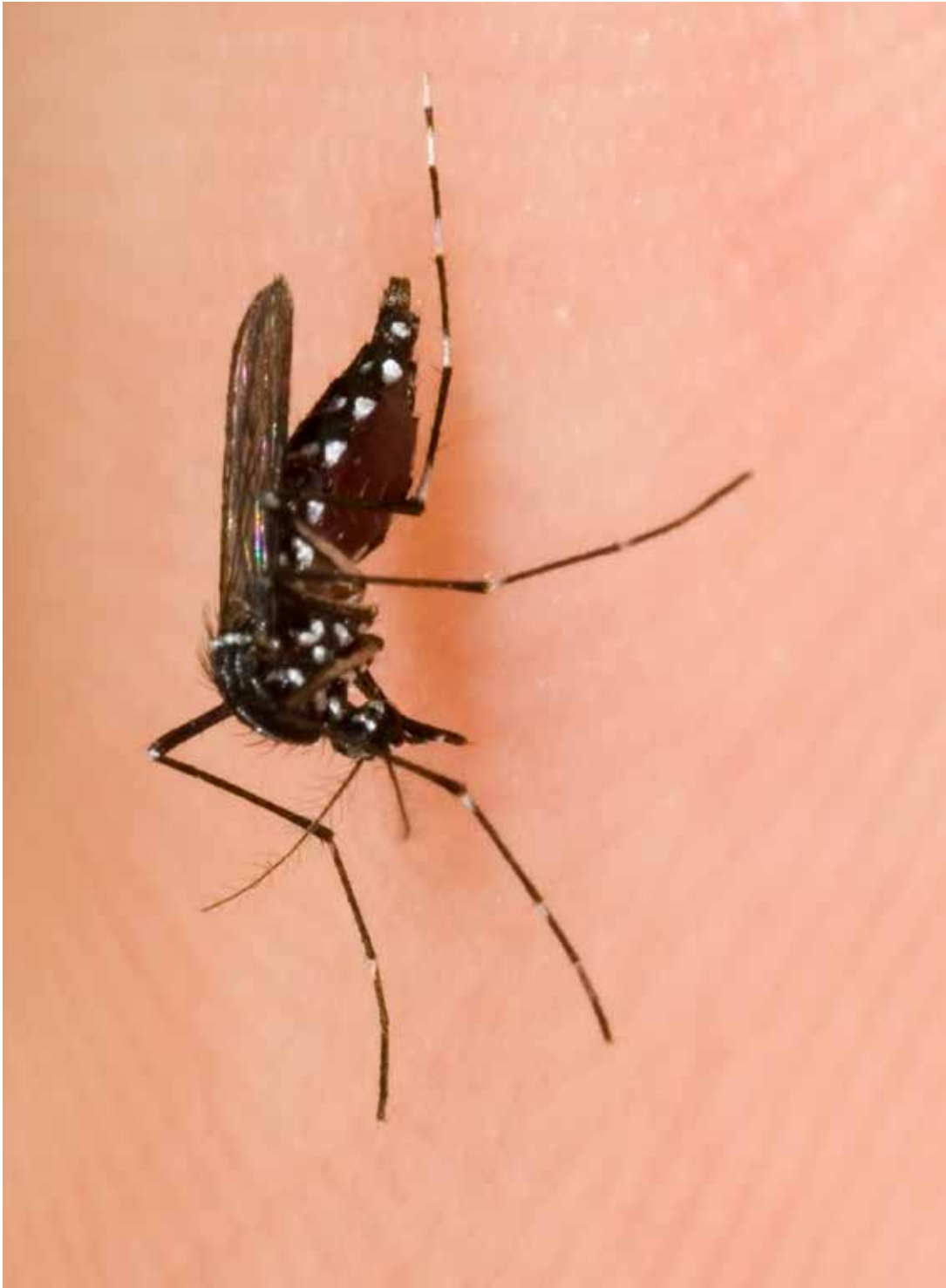
You are stung by an insect.