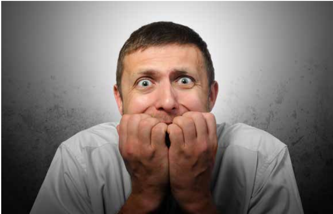
You may feel anxious.