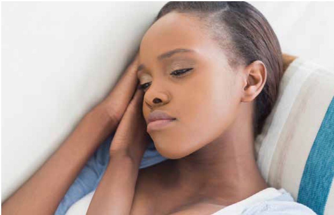
You may feel overly tired.