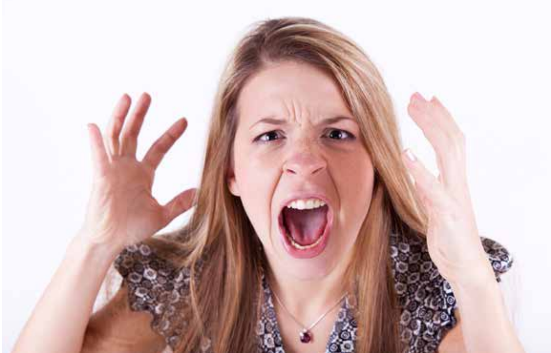
You may feel angry.