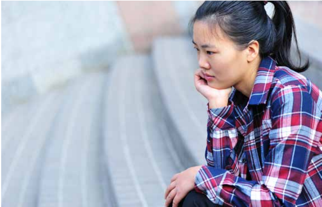
You may feel lonely or isolated.