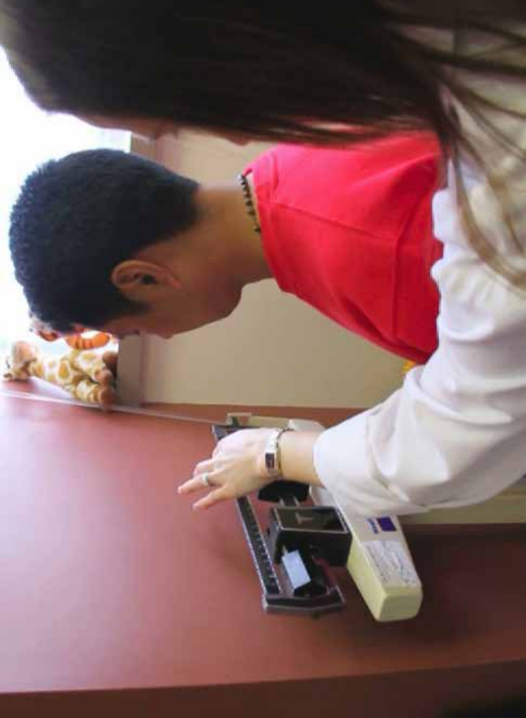
Make an appointment at a health clinic.