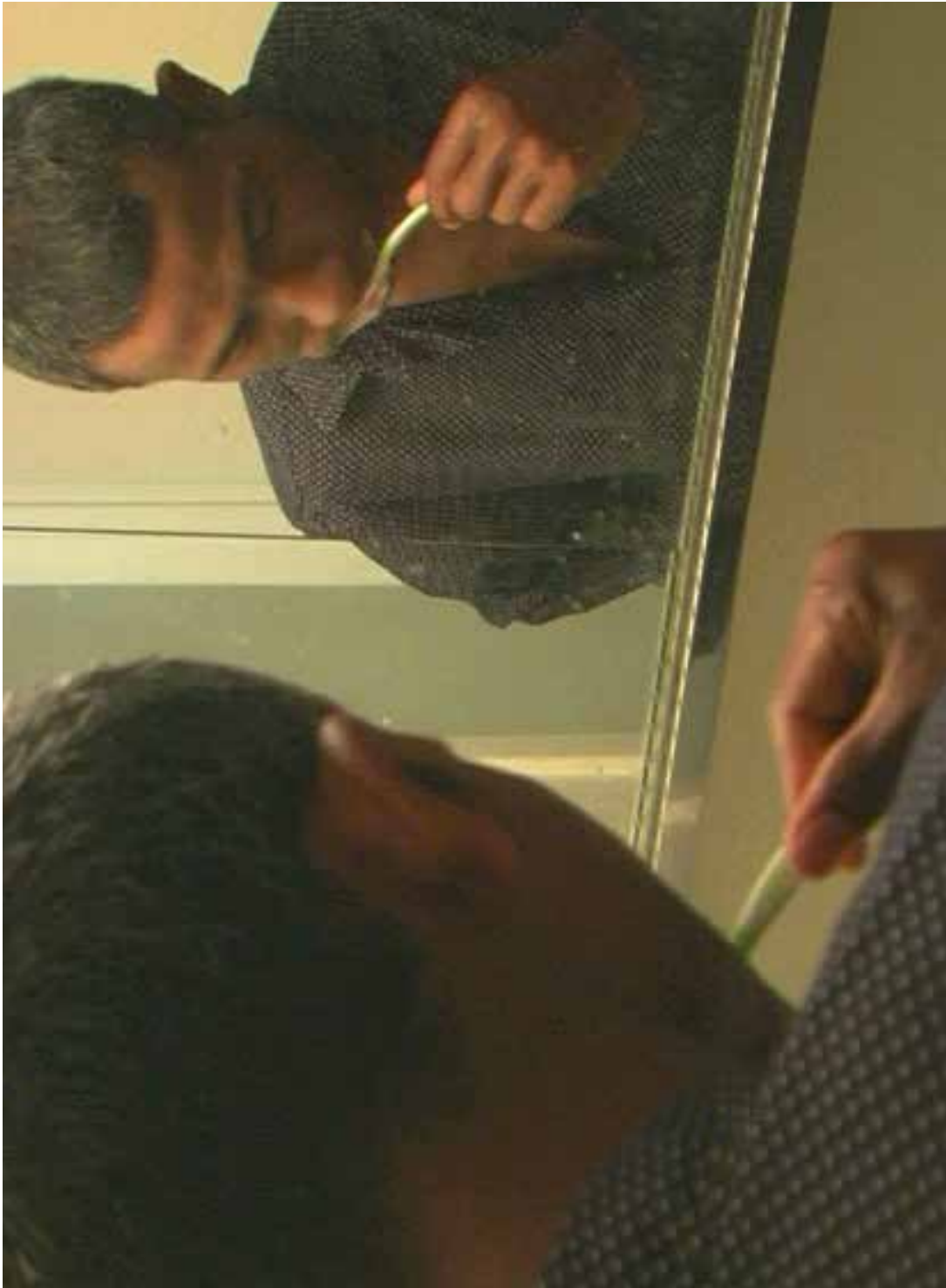
Brush your teeth twice a day.