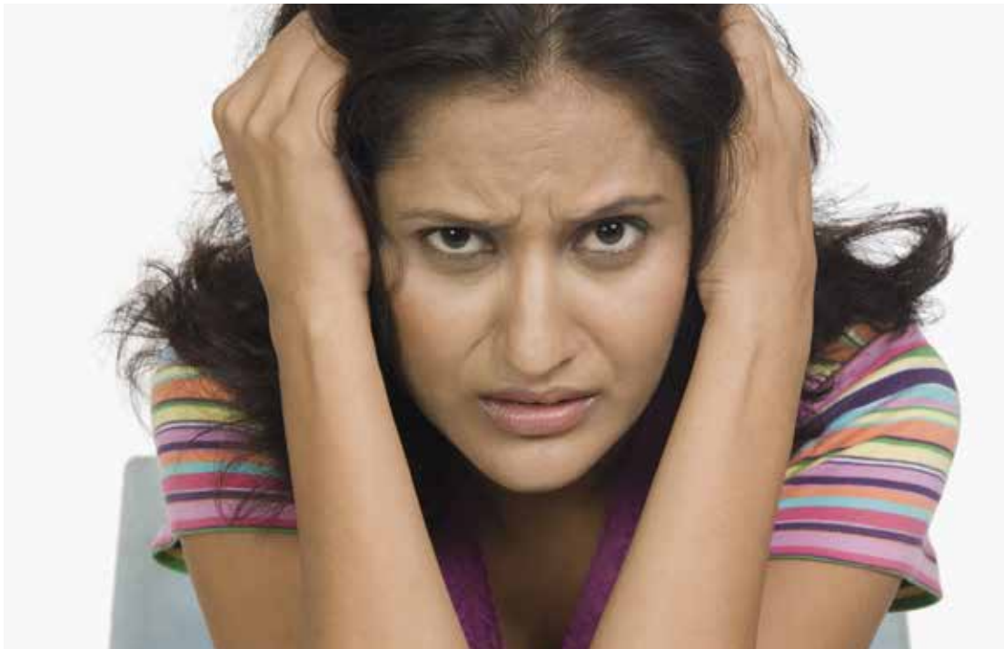
You may feel frustrated.