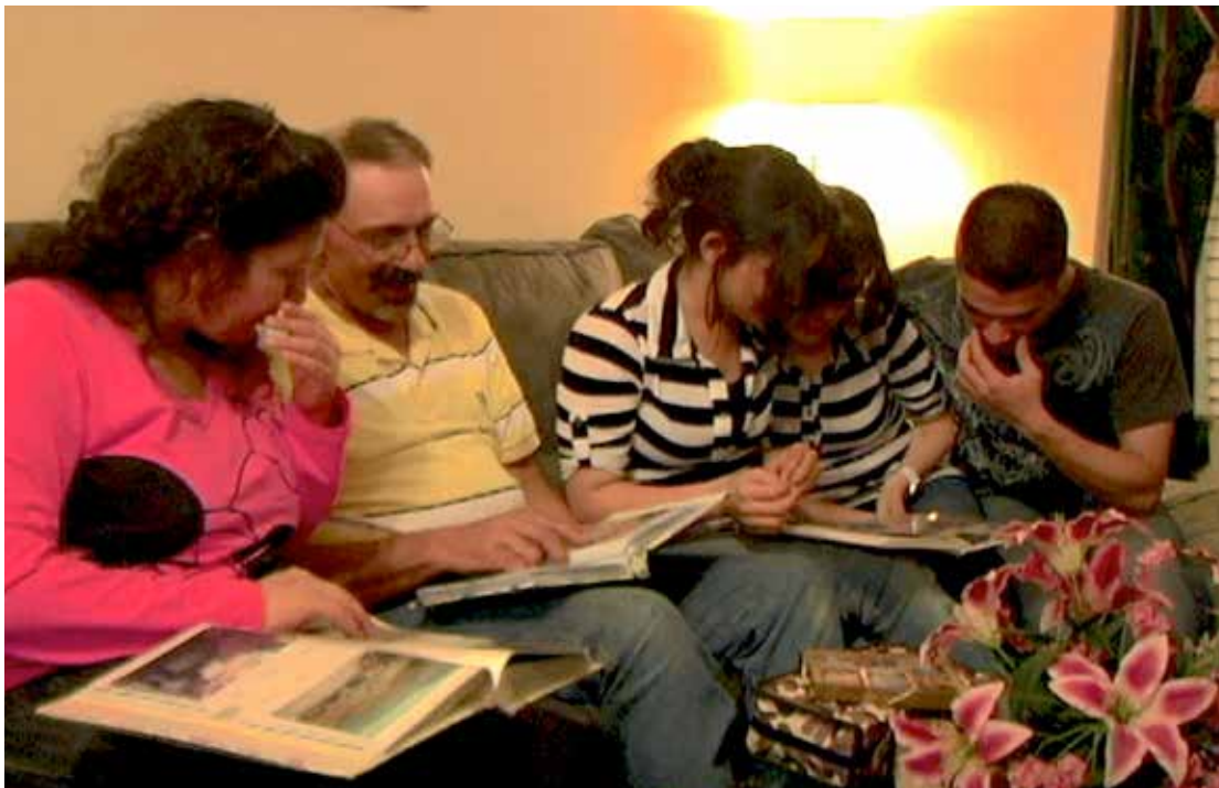
You may feel homesick.